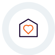
Aged Care & Retirement Living

We endeavour to explore, together with the design team, the available cutting-edge technology where material limitations are pushed to the limits.