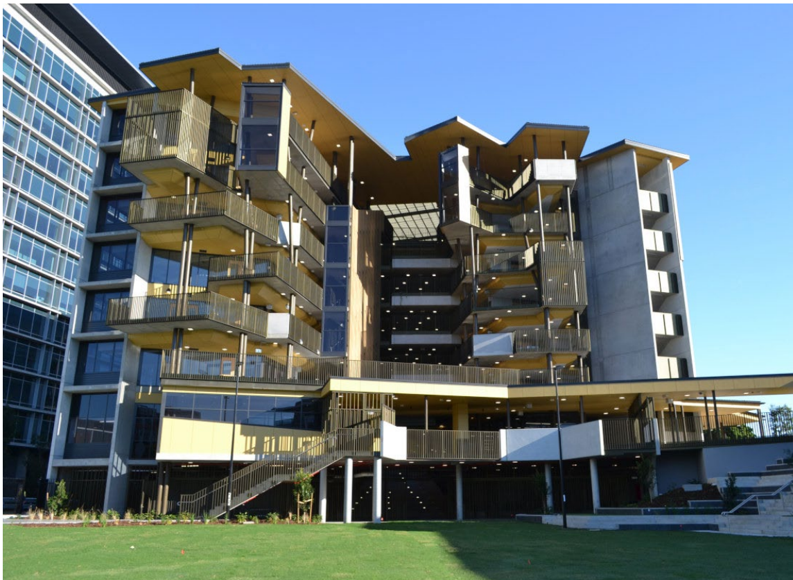
Fortitude Valley State Secondary College - Brisbane, QLD, Australia.

At BG&E, our expertise in the education sector extends beyond the buildings themselves. We recognise the critical role education facilities play in shaping communities - enhancing learning experiences, fostering social connections, driving local development, and strengthening economies.