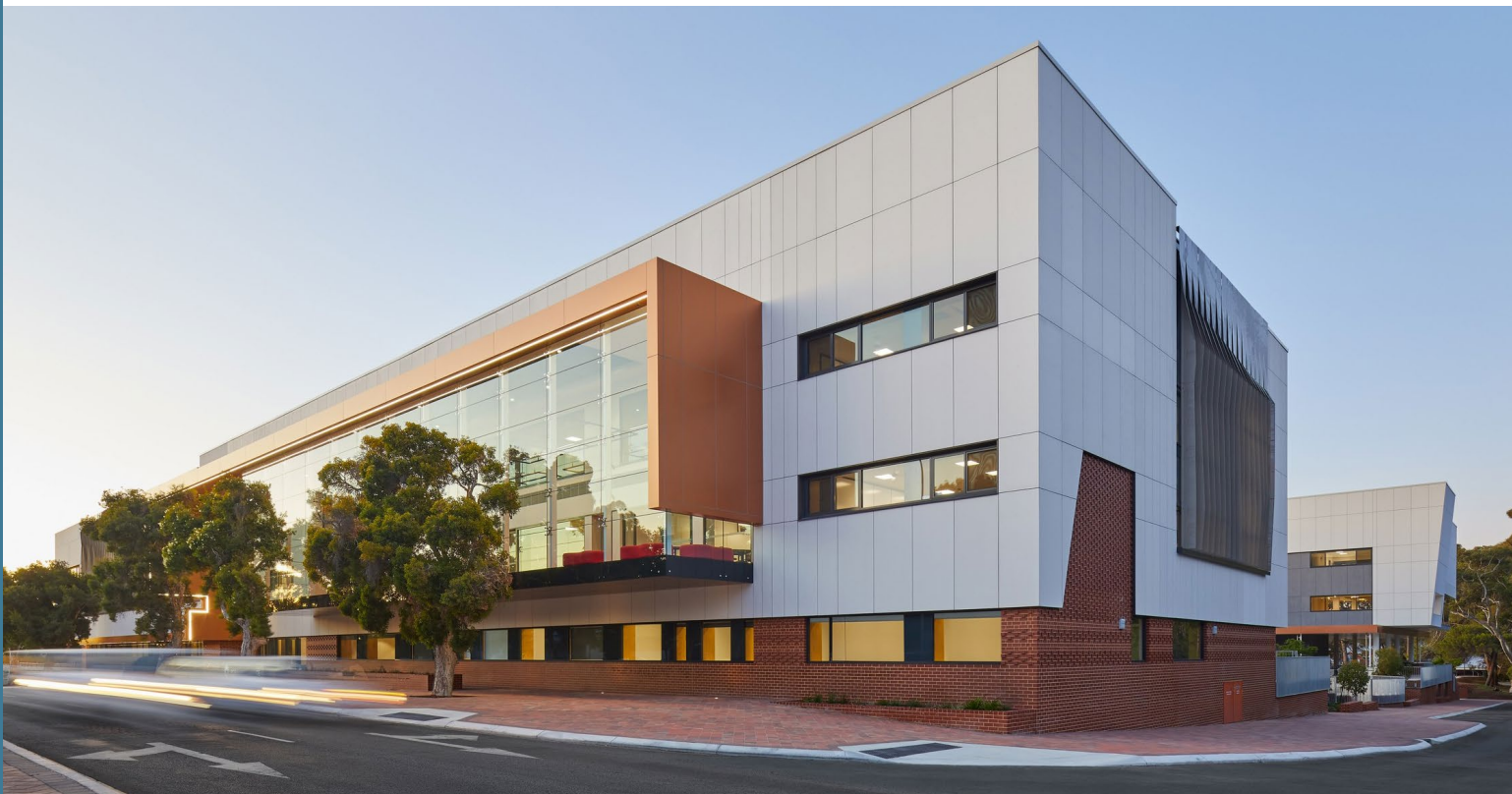
Bob Hawke College - Perth, WA, Australia.