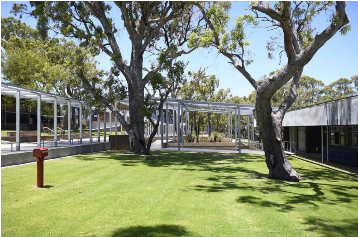
Carine Senior High School – Perth, WA, Australia.

This redevelopment not only addresses the current needs of the school community but also positions Carine Senior High School as a beacon of innovative and inclusive education for the future.