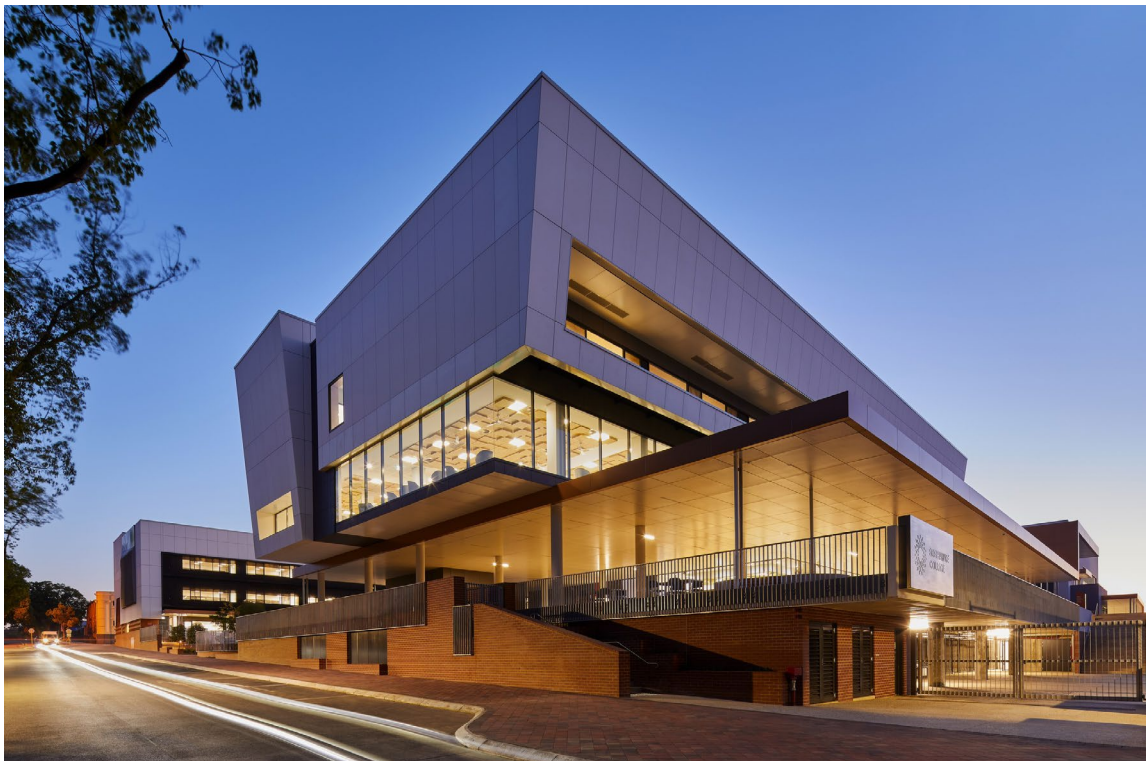
Bob Hawke College – Perth, WA, Australia.

By 2025, this institution of academic excellence will accommodate up to 2,500 students.