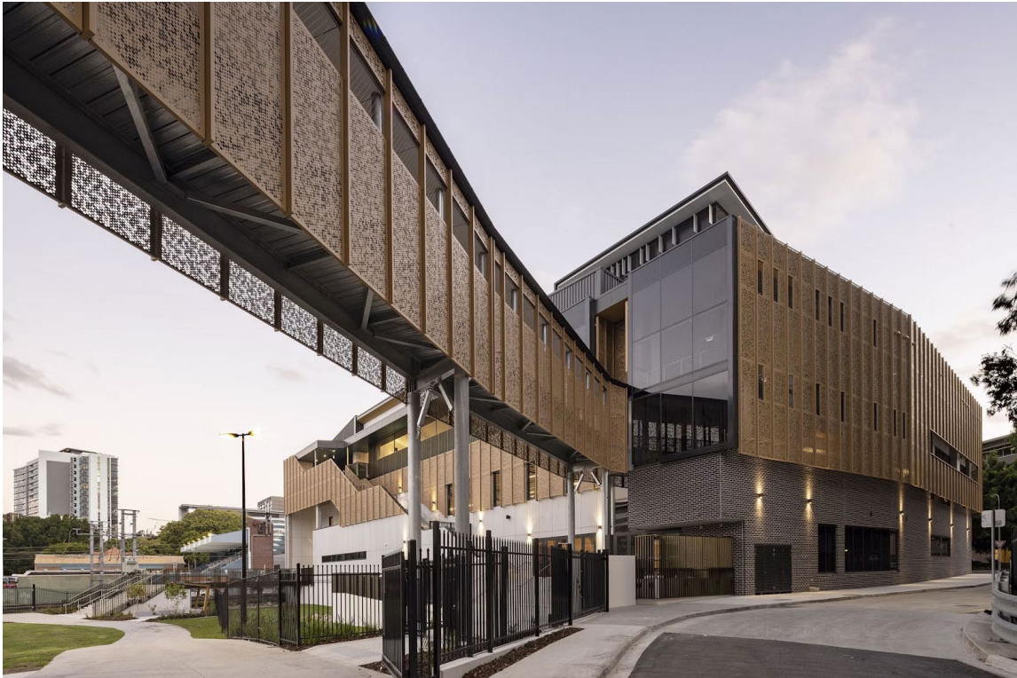
Fortitude Valley State Secondary College – Brisbane, QLD, Australia.

BG&E's scope also covered the erection sequencing of precast components to assess their strength at various stages and the design of all temporary works to ensure stability. The team produced 4D-rendered animations, aiding communication of the construction sequence to on-site trades.