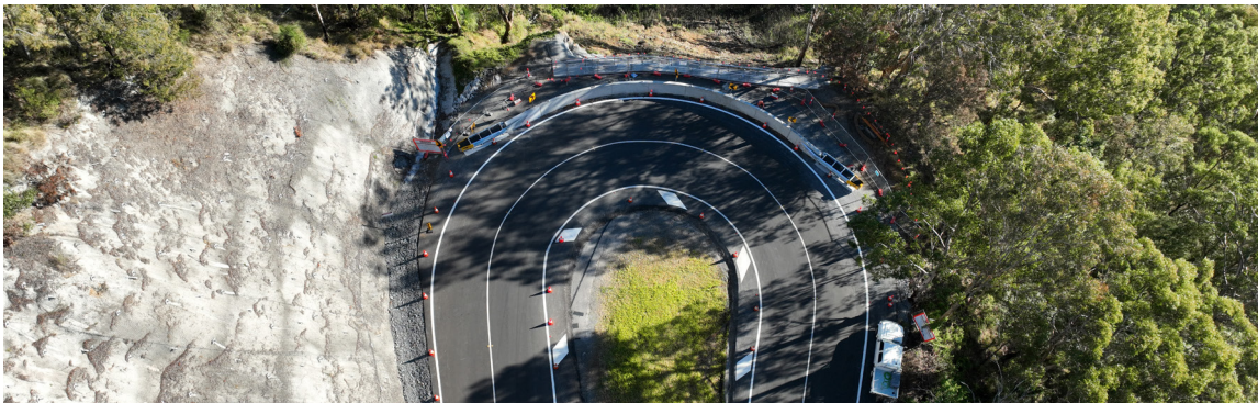
DRFA 22A Urgent REPA – Lamington National Park Road, QLD, Australia.

At BG&E, our track record speaks volumes. We excel in swift responses for emergencies and disaster recovery, as attested by client testimonials highlighting our professionalism, problem-solving skills, and ability to get the job done.