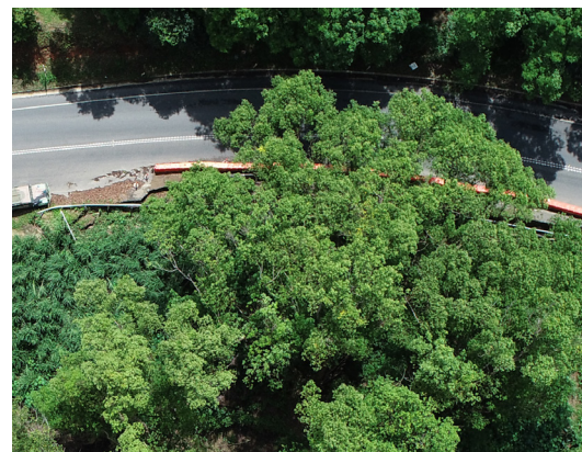
Flood Restoration Works – Kyogle Road, Tweed Shire Council, NSW, Australia.