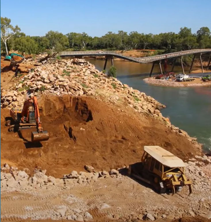
Fitzroy River Bridge - Kimberley Region, WA, Australia.