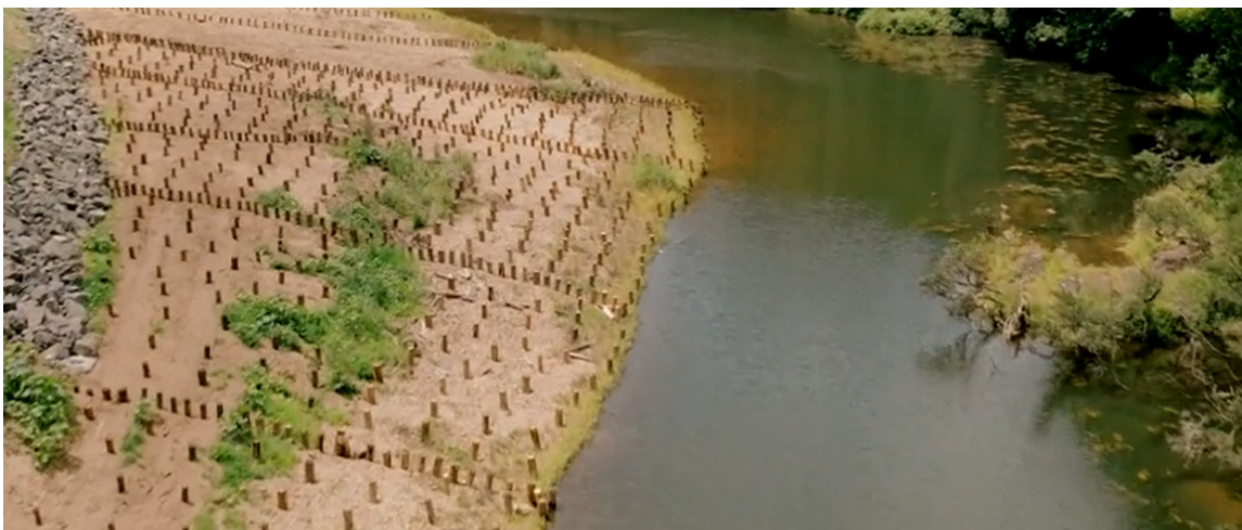
Severe Weather & Flooding, 2022 - Tweed Heads, NSW, Australia.