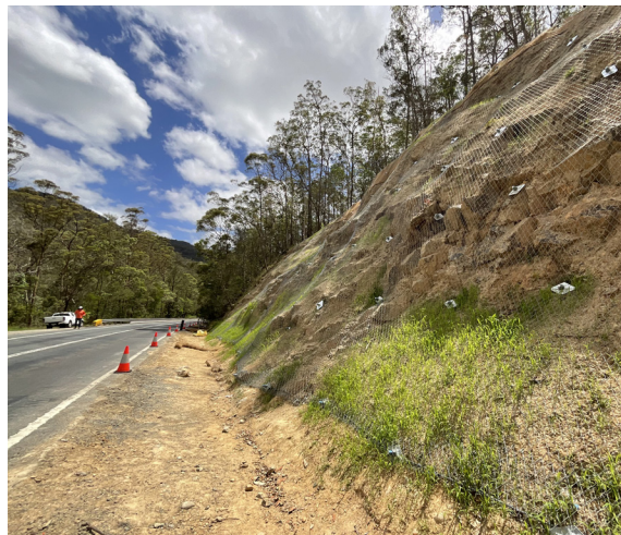
Extreme Weather Event Reconstruction Works, 2021 - Southern QLD, Australia.