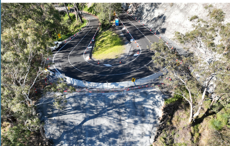
Flood Reconstruction Works, 2022 - Southern QLD, Australia.

BG&E maintained a high level of resilience in delivering the program through to construction phase support under tight timeframes. The technical quality, high degree of damage assessment and treatment optioneering was able to achieve value for money and full eligibility for the entire program. BG&E's proactive approach has been pivotal in aiding recovery efforts in these affected LGAs.