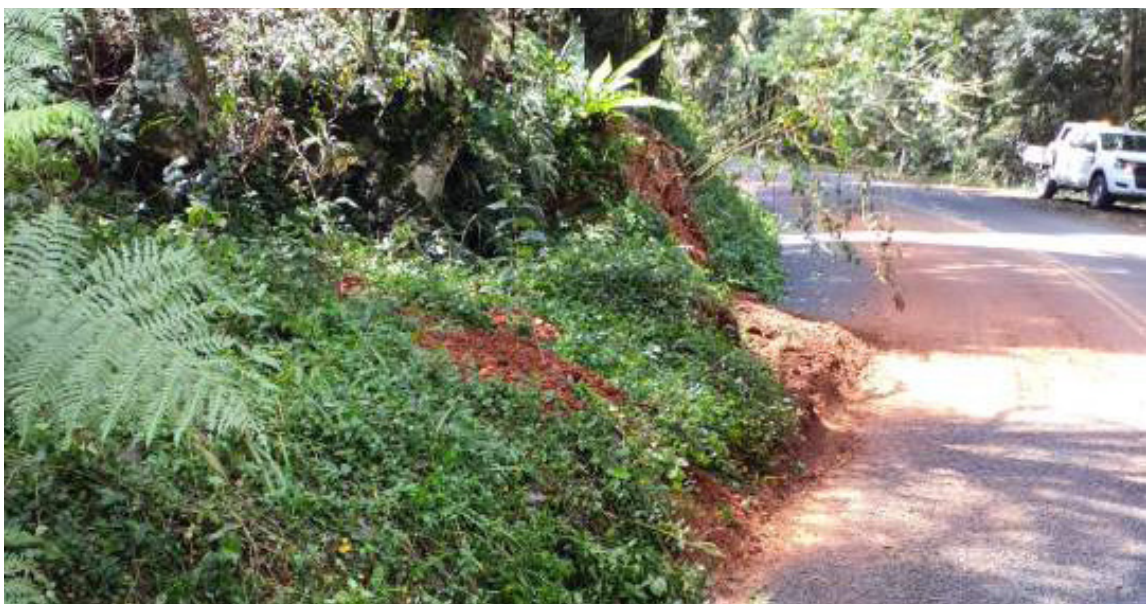
Flood Reconstruction Works, 2023 - Southern QLD, Australia.

The technical quality, high degree of damage assessment and treatment optioneering was able to achieve value for money and full eligibility. BG&E's proactive approach has been pivotal in aiding recovery efforts in these affected regions.