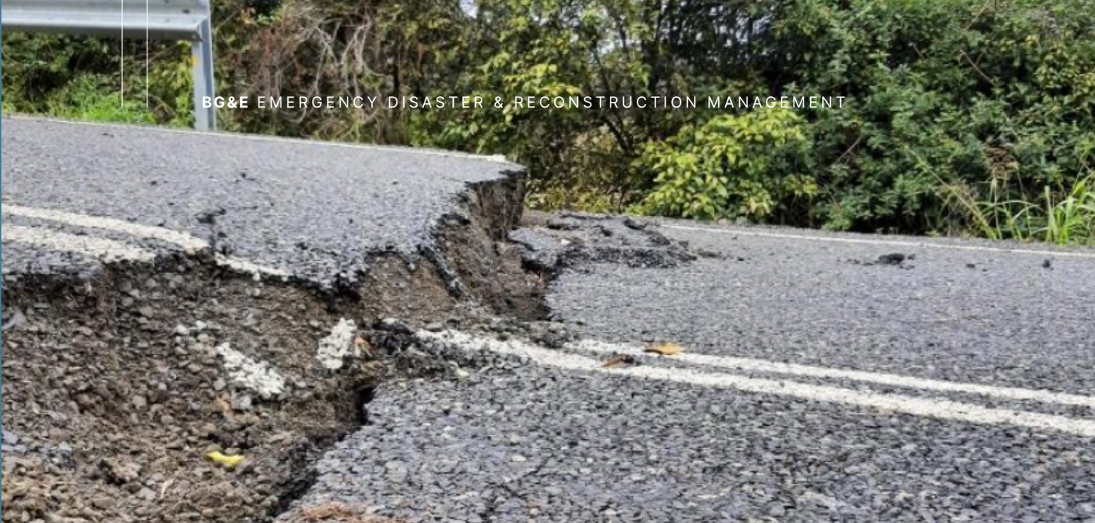
Severe Weather & Flooding, 2022 - Richmond Valley, NSW, Australia.

Richmond Valley Council, in conjunction with Transport for NSW (TfNSW), took decisive action by formulating the initial eligibility concept. The project aimed to create a design adhering to current NSW disaster relief guidelines and deliver construction-ready specifications for required treatments. These treatments were designed to restore Naughtons Gap Road to its pre-disaster state and improve its design life capacity to deal with heavy rainfall events and suboptimal ground conditions.