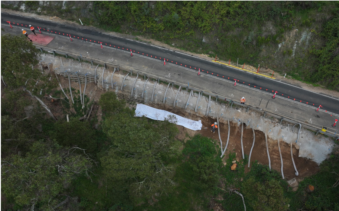
Works & Geological Mapping , 2023 - Blue Mountains, NSW, Australia.

In addition to the temporary works for the Hampton Downslope Remediation project, BG&E's commission encompassed geotechnical soil nail inspections and geological mapping, ensuring comprehensive stabilisation and recovery efforts in the affected area.