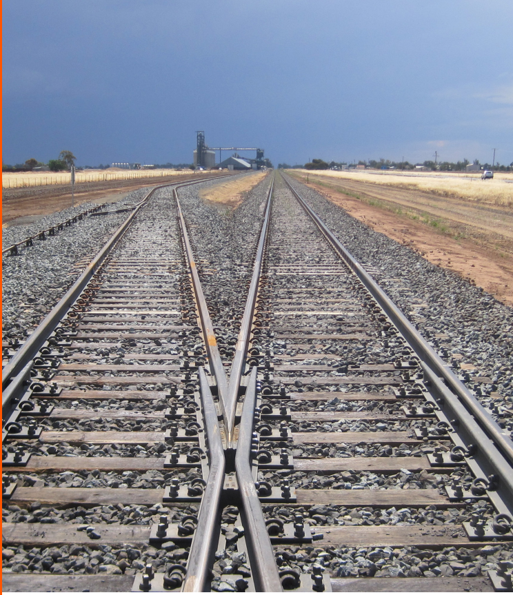
Nevertire Siding Extension - Regional NSW, Australia.