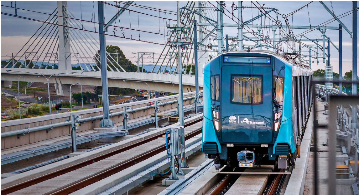
Sydney Metro – Sydney, NSW, Australia.

BG&E's Rail team is a leading provider of comprehensive rail engineering services, tailored to meet the unique requirements of different sectors and geographies.