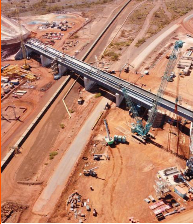
Eliwana Mine Bridges – Pilbara, WA, Australia.