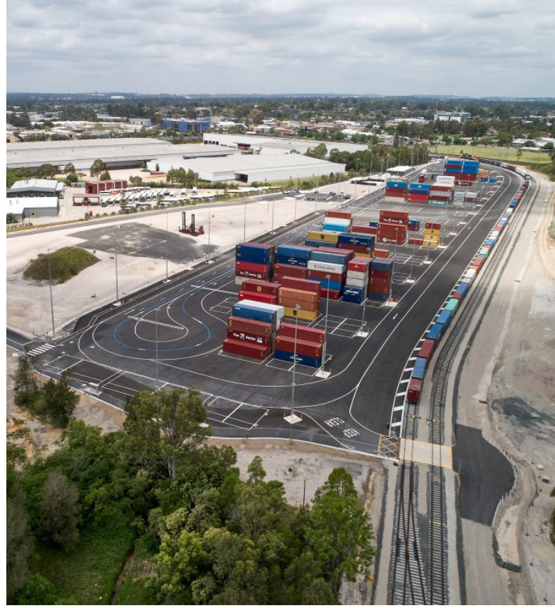
St Marys Intermodal Facility - Sydney, NSW, Australia.