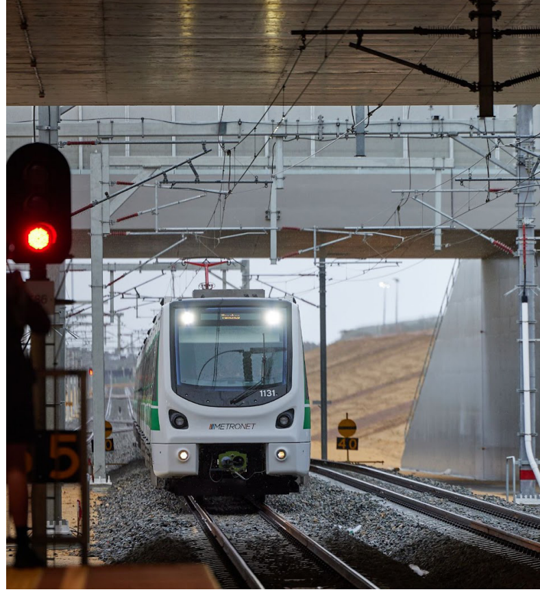
Yanchep Rail Extension – Metronet – Perth, WA, Australia.