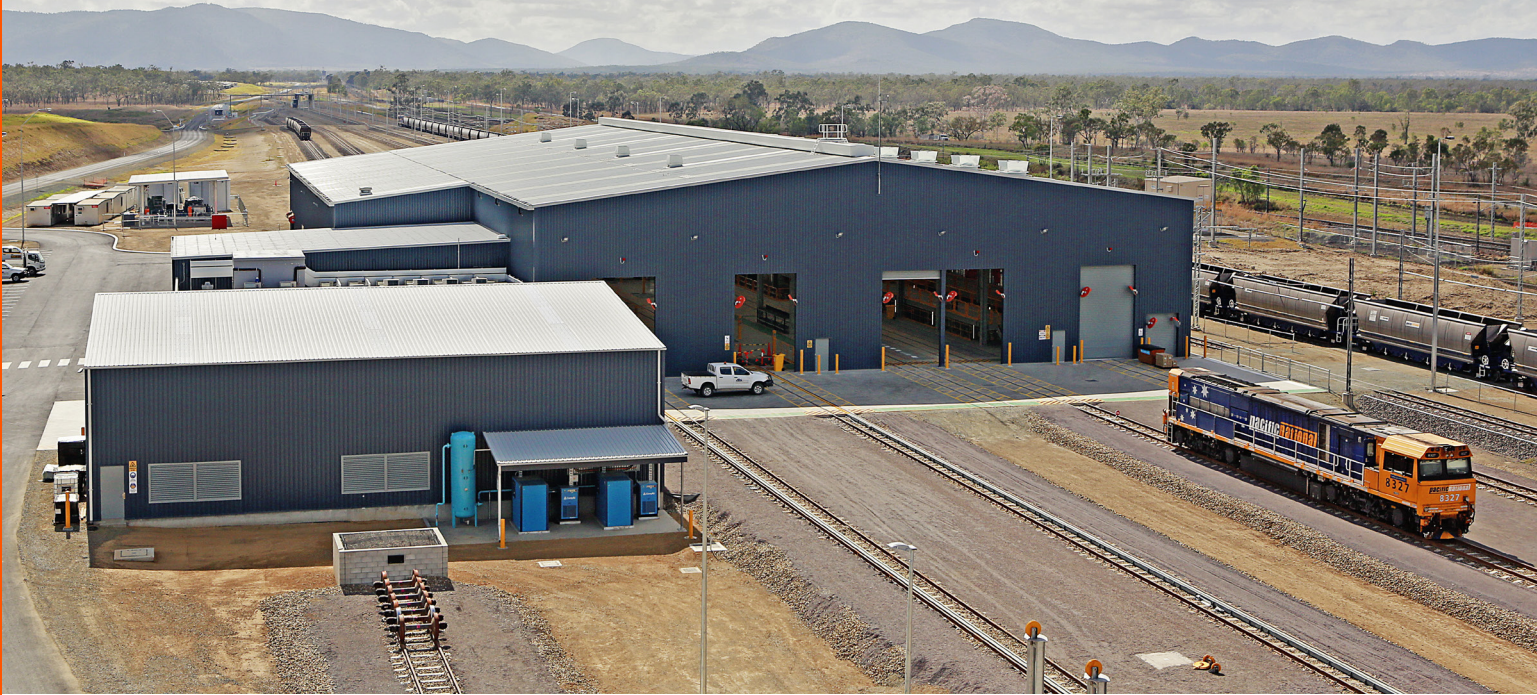
Nebo Train Maintenance Facility – Nebo, QLD, Australia.