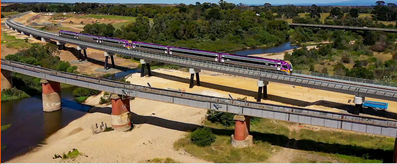
Avon River Bridge – Stratford, VIC, Australia.