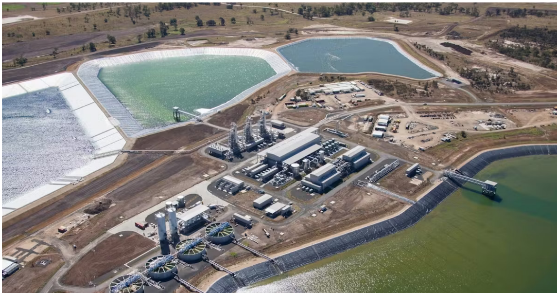
Northern Water Treatment Plant - Batemans Bay, NSW, Australia.

BG&E has recently contributed to some of Australia's largest water infrastructure projects. Through our involvement, we have further developed efficient and effective design practices that reduce Capital Expenditure (CapEX) and ensure timely delivery.