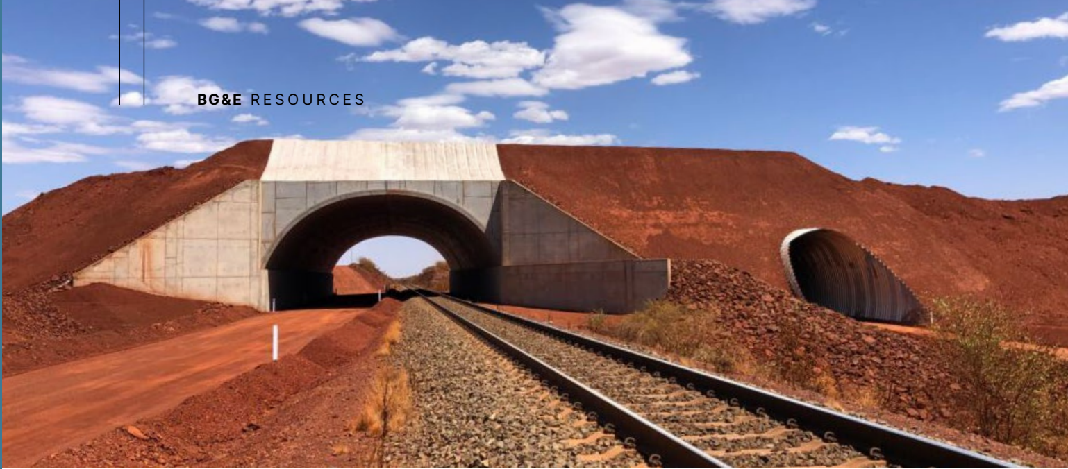
Abrolhos Overpass - Pilbara, WA, Australia.