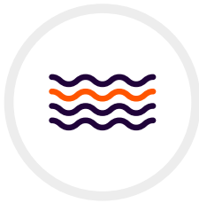
Flooding & Hydrology