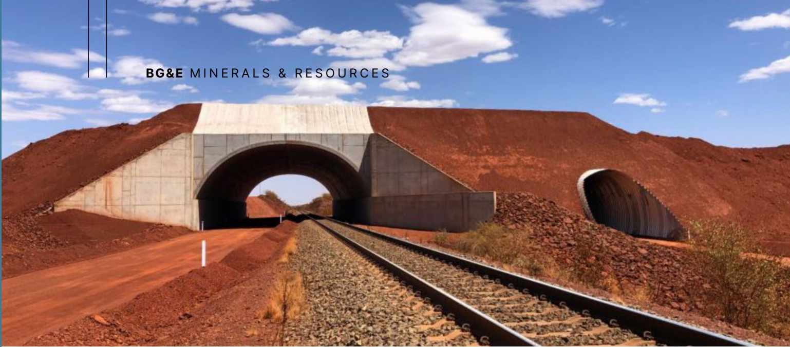
Abrolhos Overpass - Pilbara, WA, Australia.