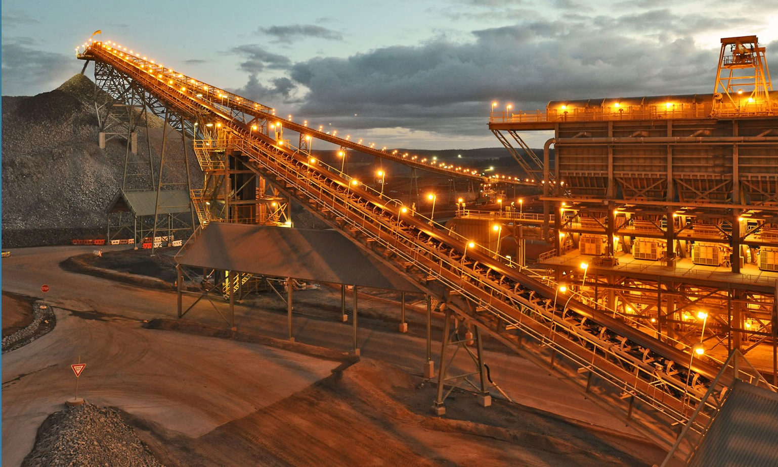
Boddington Gold Mine, Conveyor Trestle Foundations - Boddington, WA, Australia.