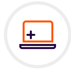
Digital Engineering (inc. BIM & GIS)