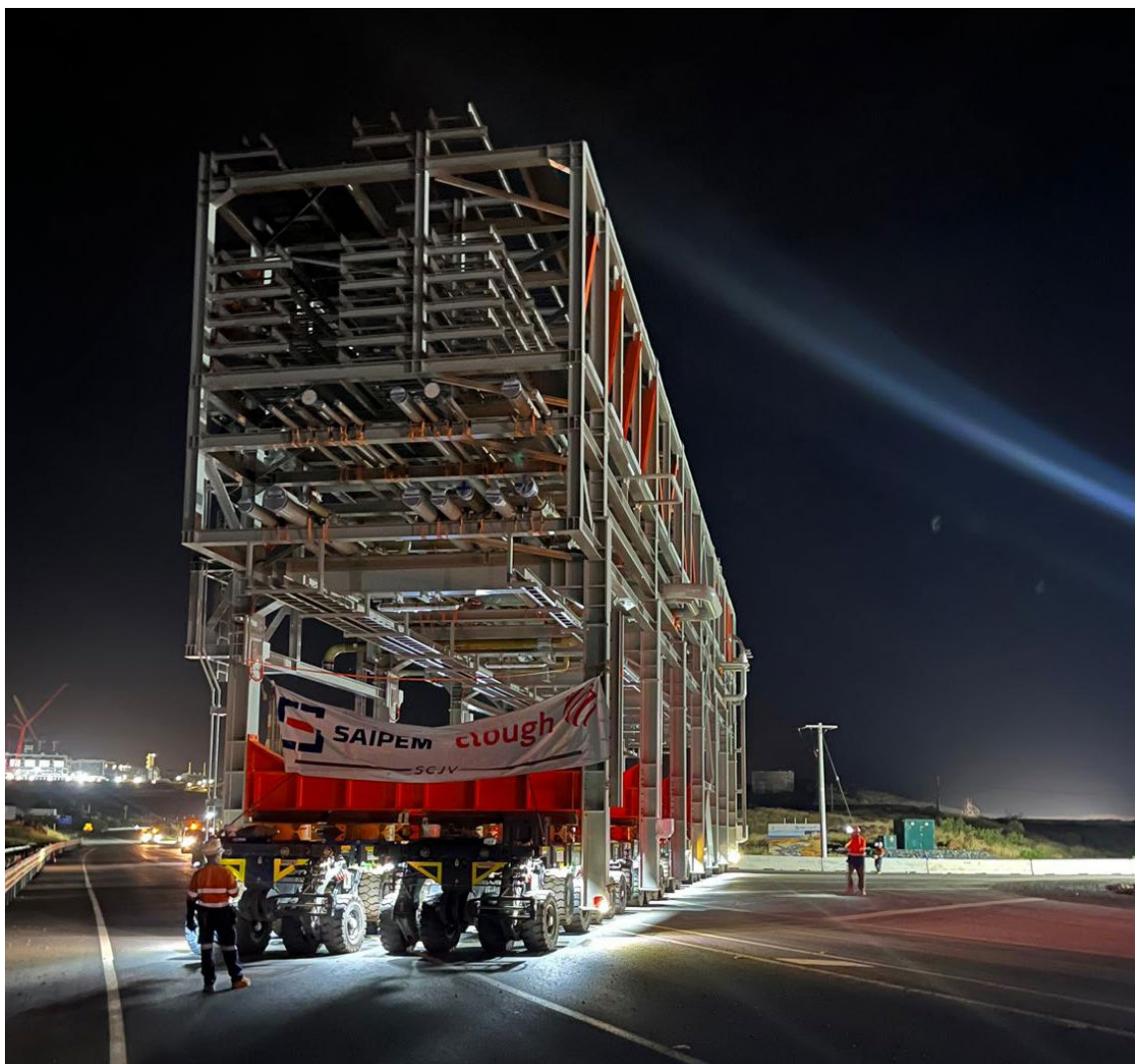
Extreme Heavy Vehicle Movements - Burrup Region, WA, Australia.

This transition must be achieved within the framework of decarbonisation, ESG commitments, and greenhouse gas emission reduction targets - environmental factors that are reshaping project pipelines and delivery methodologies.