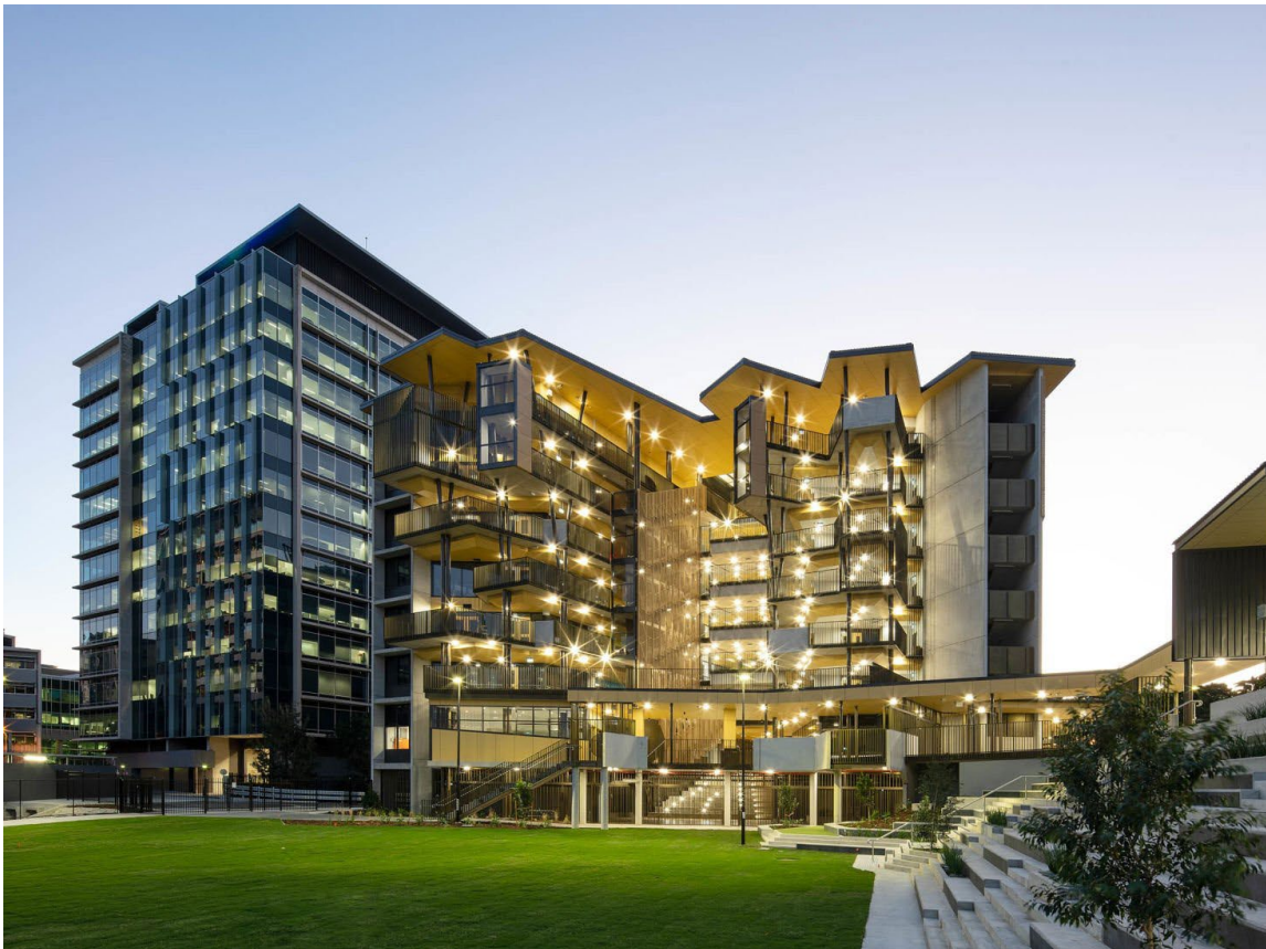
Fortitude Valley State Secondary College (Stages 1 & 2) – Brisbane, QLD, Australia.

Fortitude Valley State Secondary College sets a new benchmark for State education facilities and bolsters Brisbane's position as a leading provider of high-quality services.