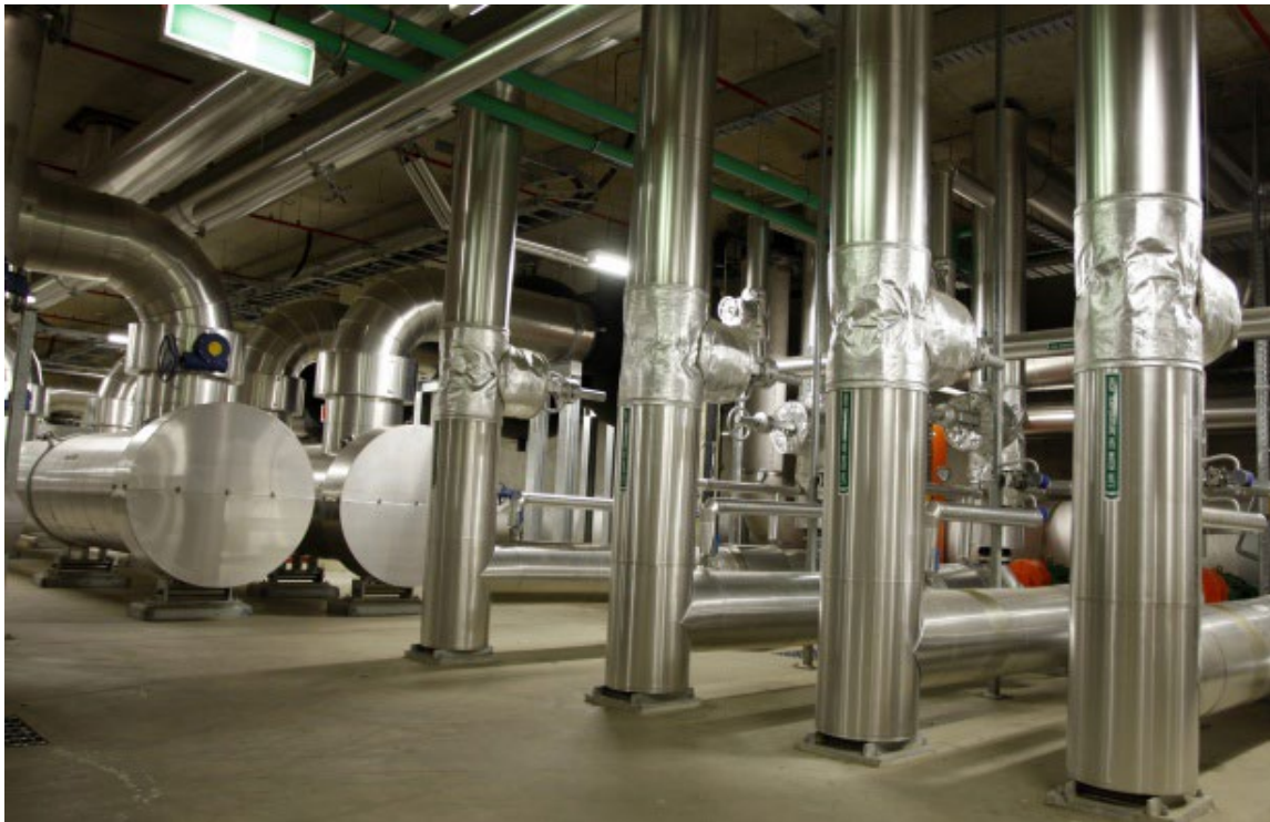
Queen Elizabeth II Central Energy Plant – Nedlands, WA, Australia.

The 500 metre service tunnel, measuring five metres deep and eight metres wide, was constructed with contiguous piles and an in-situ concrete floor, the tunnel is designed to support traffic loads above.