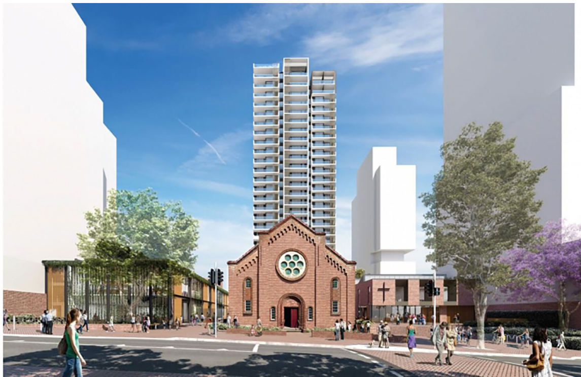
Levande The Cambridge - Epping, NSW, Australia.

Levande The Cambridge is currently under construction and is slated for completion by early 2025.