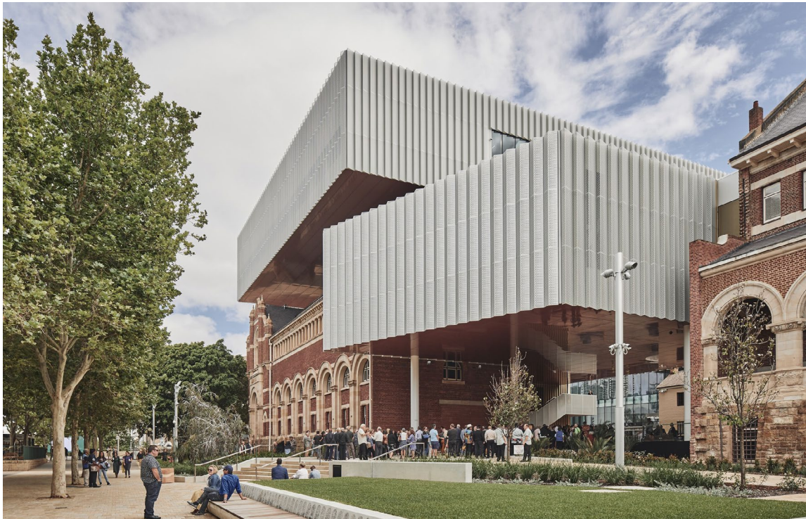
WA Museum Boola Bardip - Perth, WA, Australia.