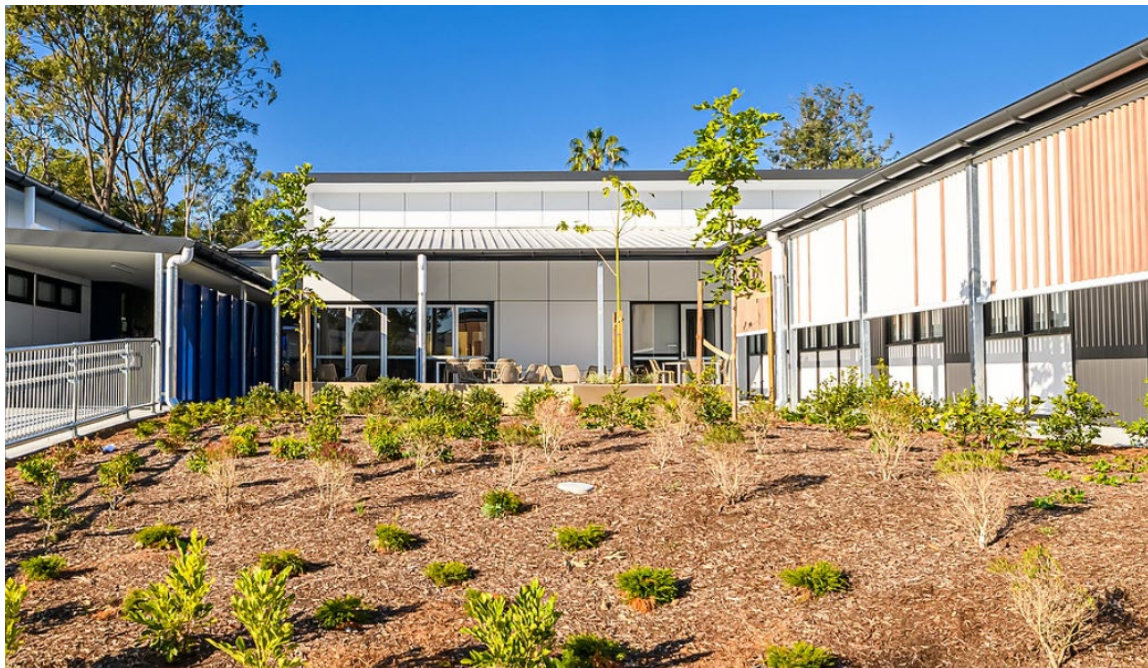
Park Ridge State School - Brisbane, QLD, Australia.

The new primary school is being constructed in the growing region of Logan, south of Brisbane, to enhance the local schooling network and provide enrolment relief to neighbouring state schools.