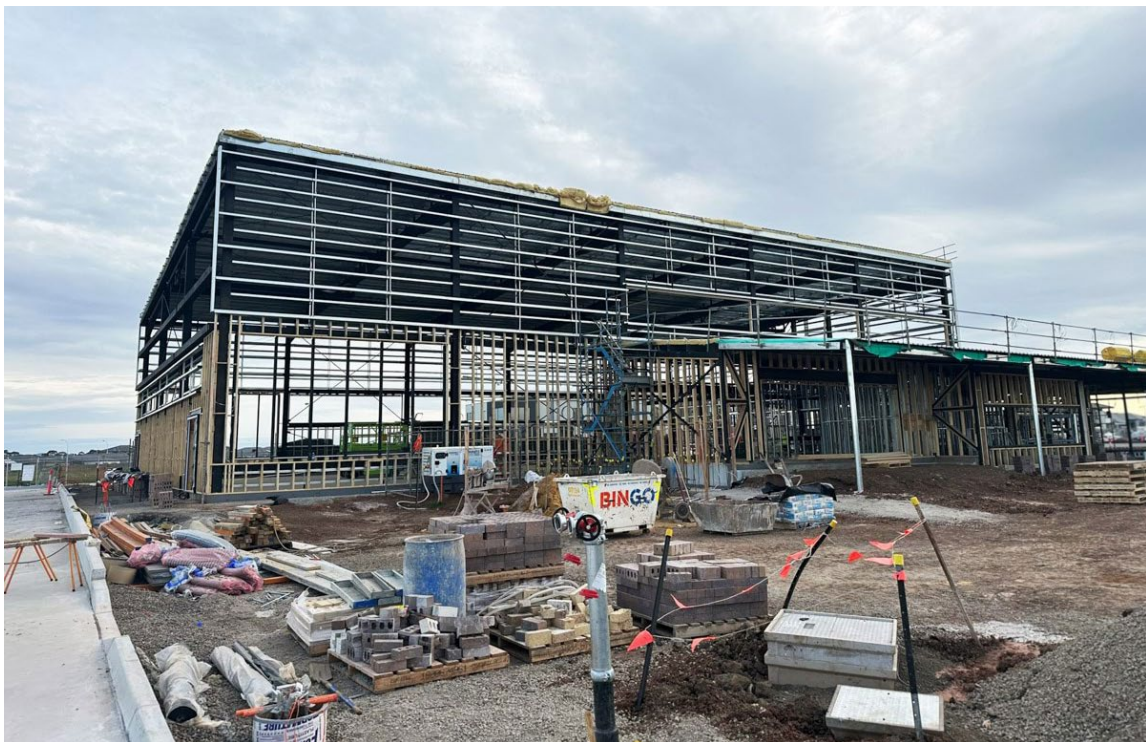
New Schools 2025: Technical Review & Advisory Services – VIC, Australia.

Each site was unique, and each delivered bundle consisted of several template buildings that could be slightly modified to suit the site specific conditions.