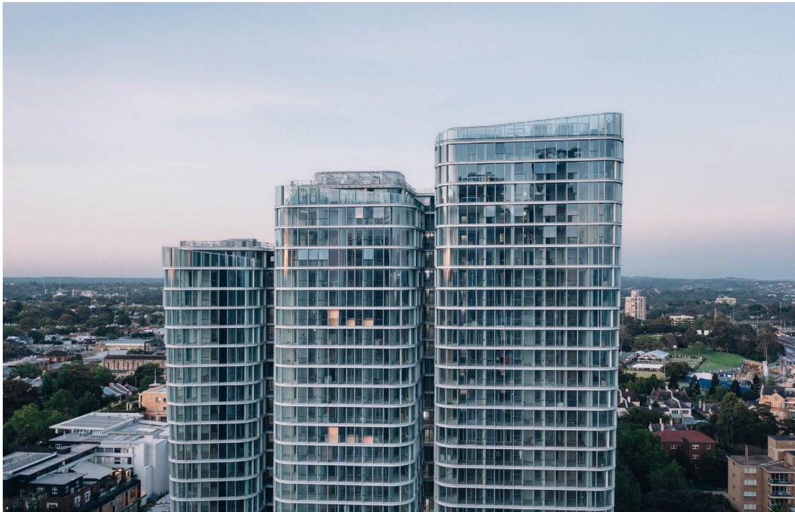
AURA by Aqualand - North Sydney, NSW, Australia

AURA's undulating façade, multi-towered design, and distinctive hourglass shape mark it as an iconic addition to Sydney's skyline.