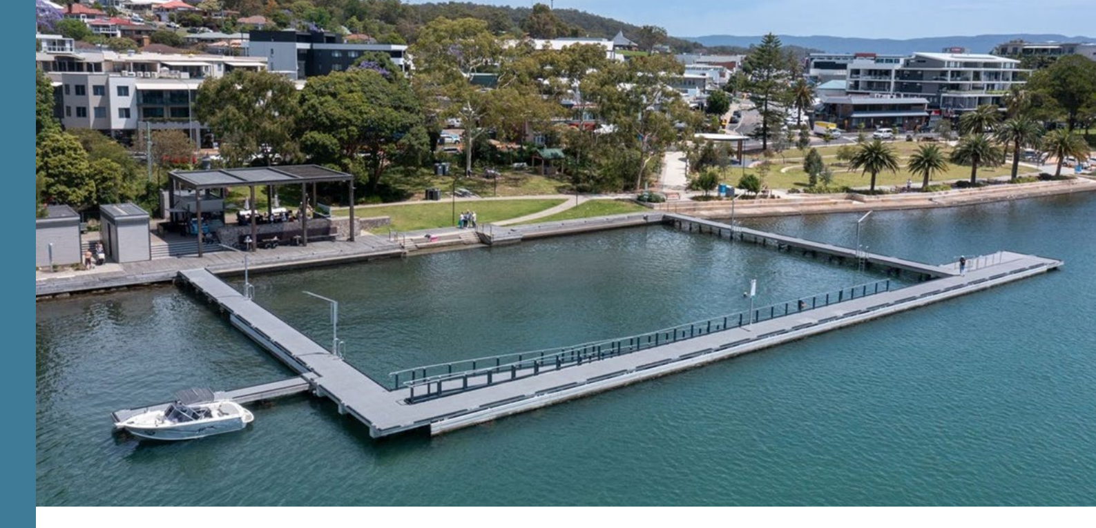
Toront Baths Jetty Upgrade -Toronto, NSW, Australia.