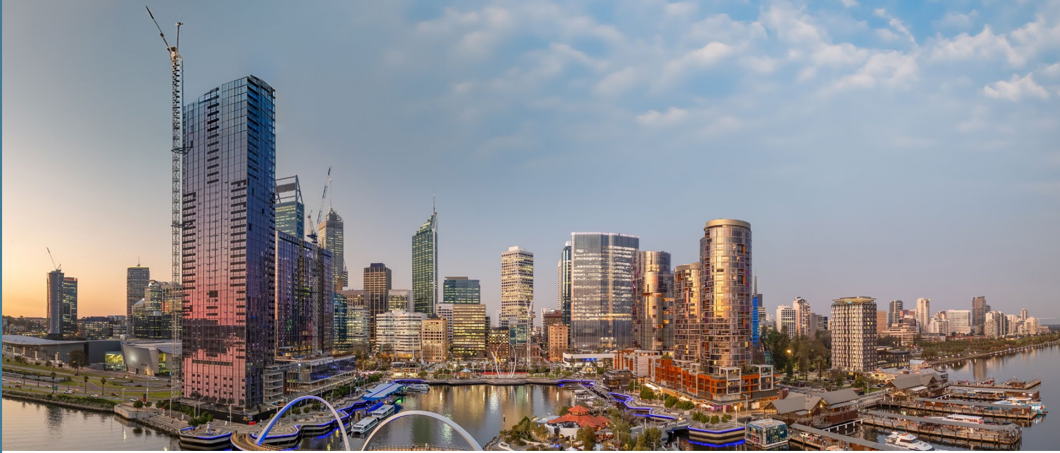
Lots 2 & 3 Elizabeth Quay - Perth, WA, Australia.