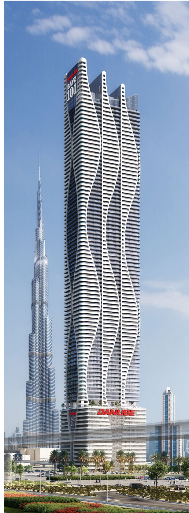
Bayz101 - Dubai, UAE.