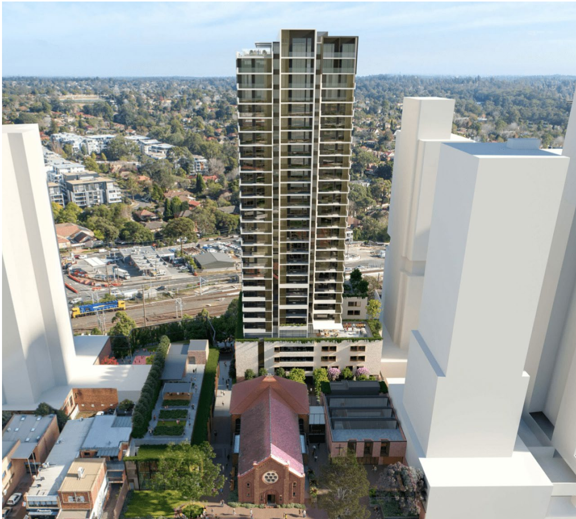
Levande The Cambridge - Epping, NSW, Australia.

Levande The Cambridge is currently under construction and is slated for completion by early 2025.