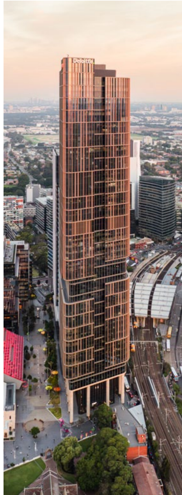
Parramatta Square - Parramatta, NSW, Australia.