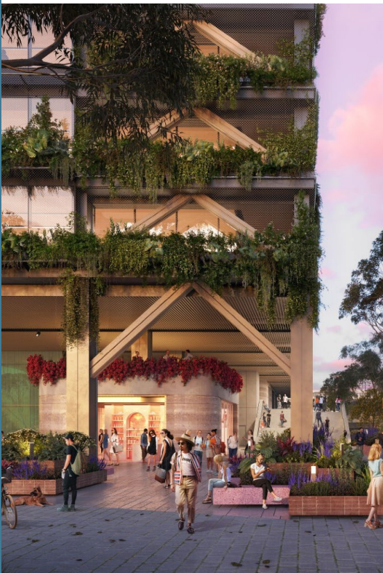
Castle Towers - Sydney, NSW, Australia.