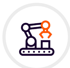
Materials & Durability