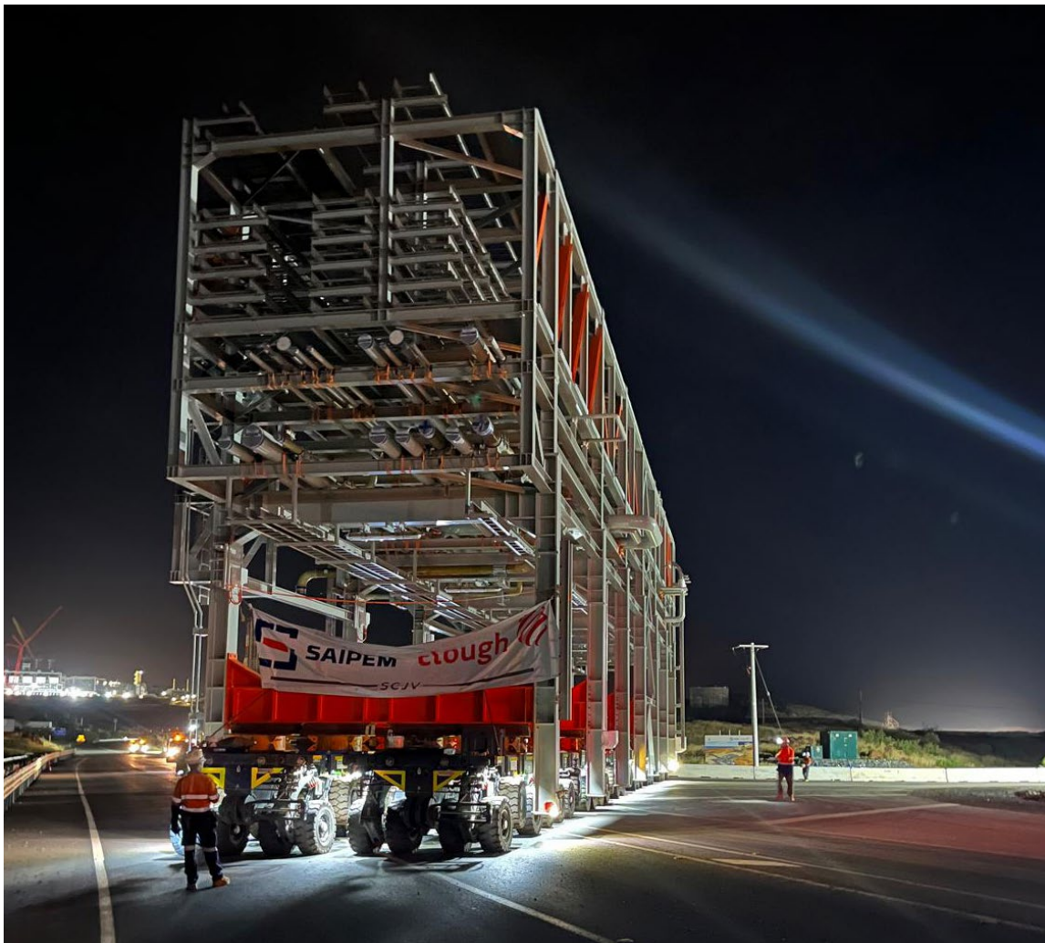
Extreme Heavy Vehicle Movements - Burrup Region, WA, Australia.

This transition must be achieved within the framework of decarbonisation, ESG commitments, and greenhouse gas emission reduction targets - environmental factors that are reshaping project pipelines and delivery methodologies.