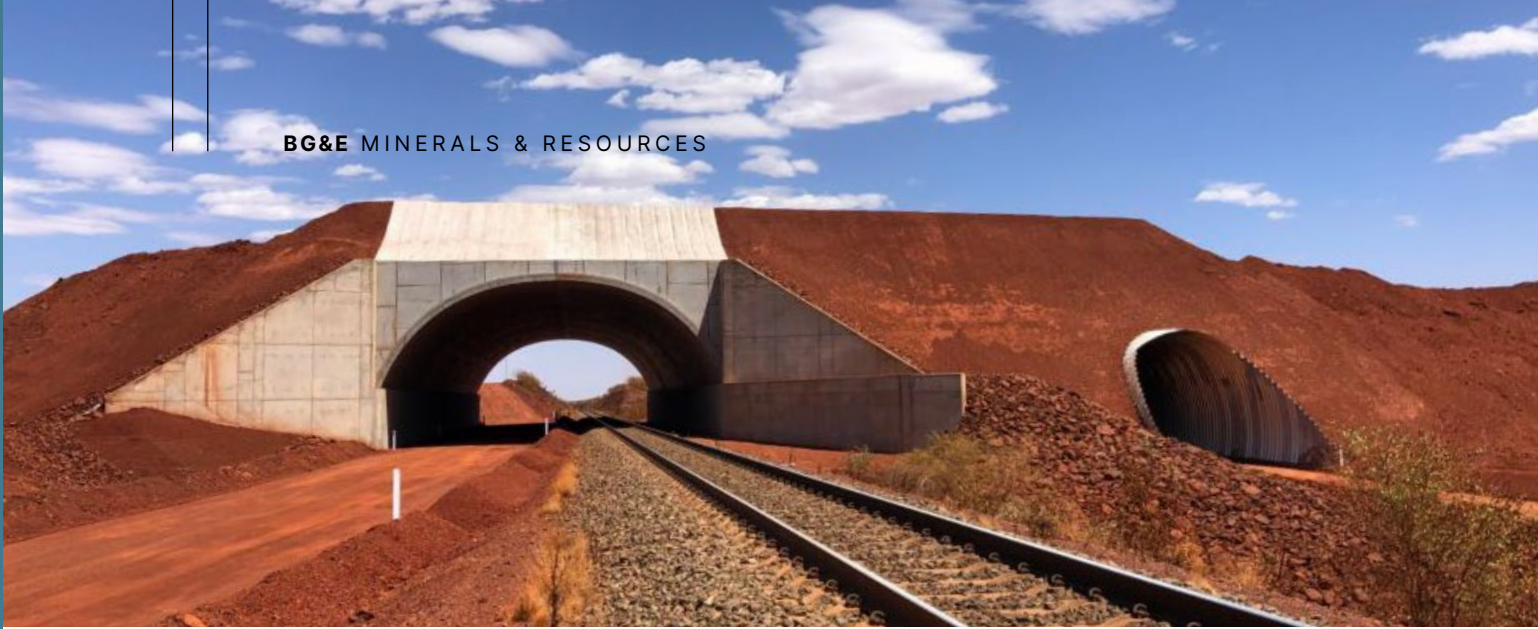
Abrolhos Overpass - Pilbara, WA, Australia.