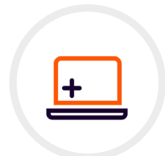
Digital Engineering (inc. BIM & GIS)