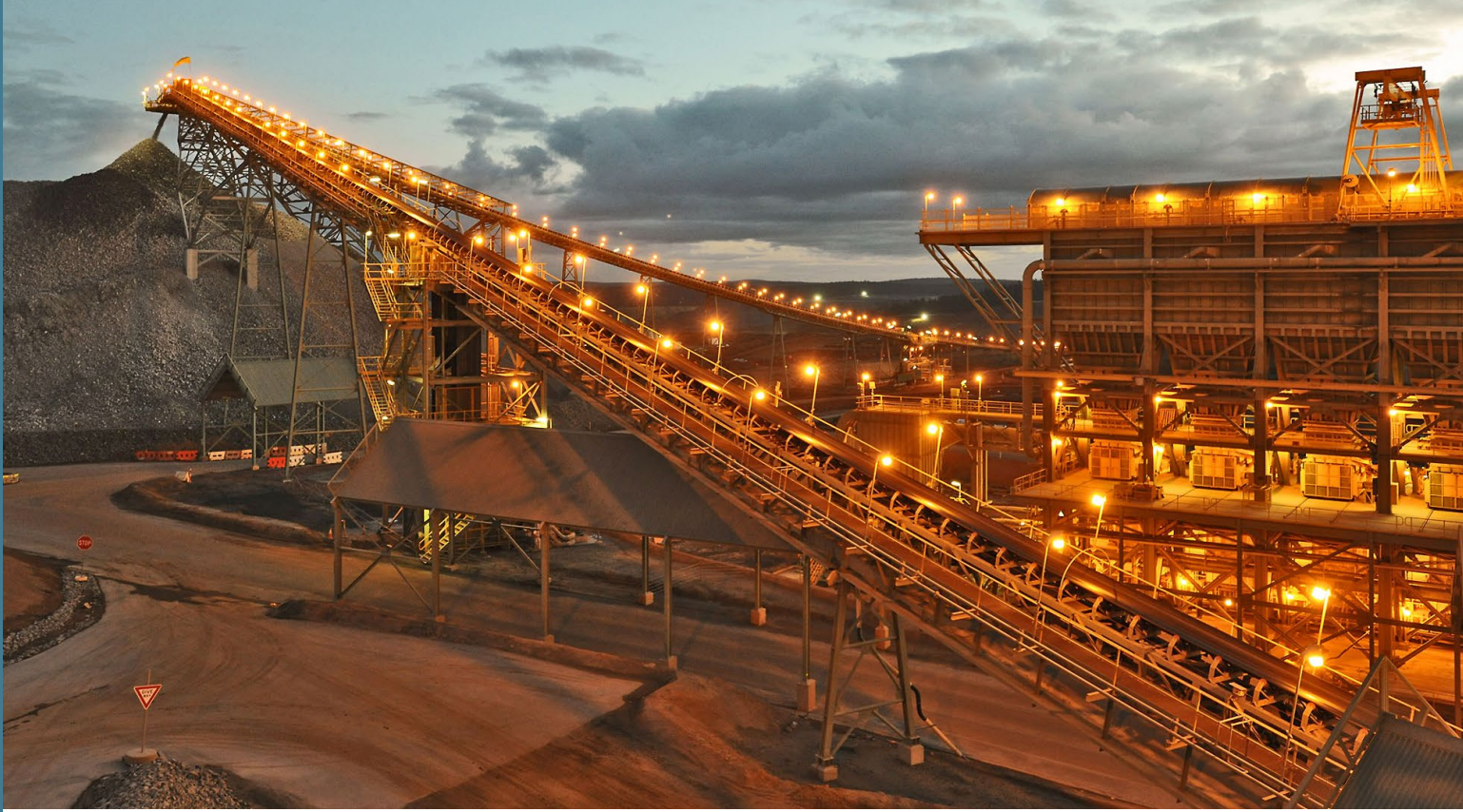
Boddington Gold Mine, Conveyor Trestle Foundations - Boddington, WA, Australia.