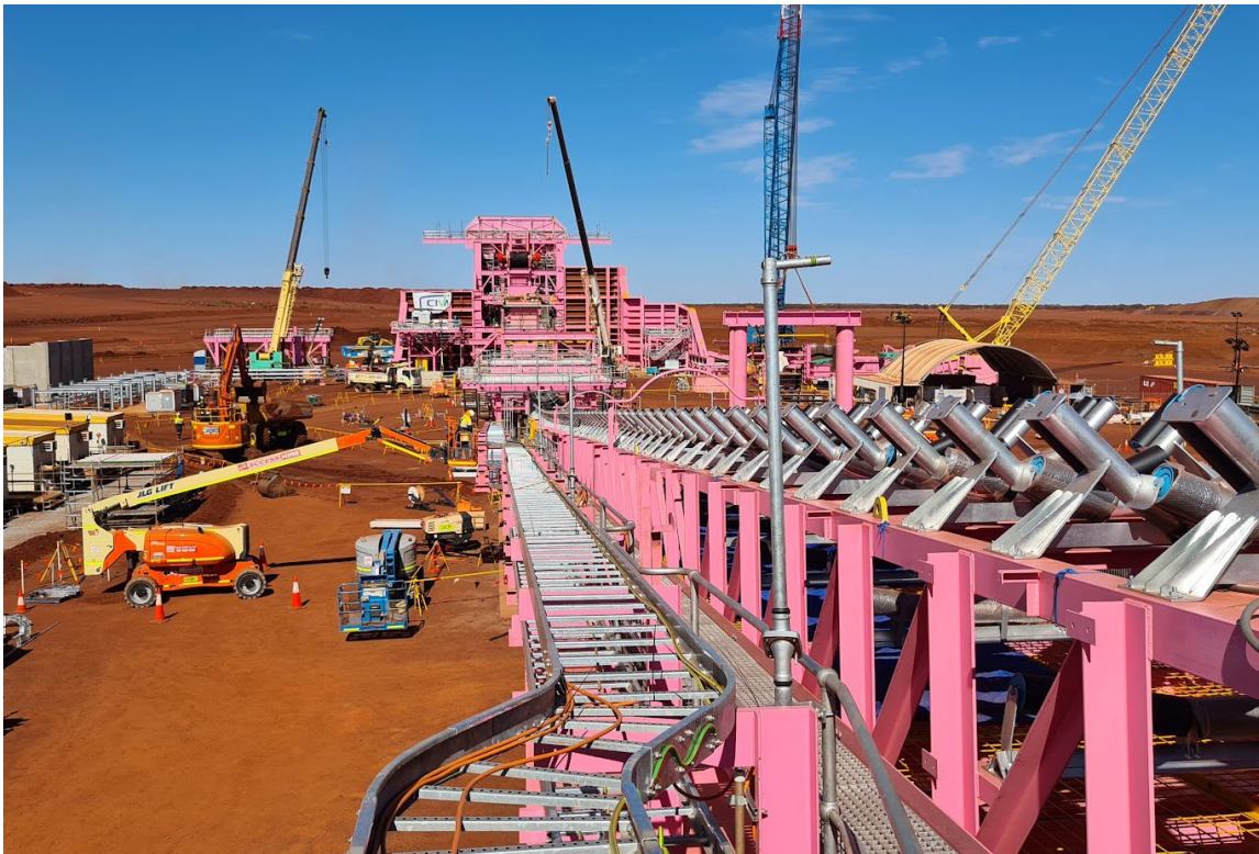
Stanley Point 3 Port Expansion - Port Hedland, WA, Australia.

Using a systems-based approach, BG&E looks at the wider context for each project and considers the long term. This holistic framework enables informed decision-making on pathways to improve outcomes that are not possible using more traditional approaches.