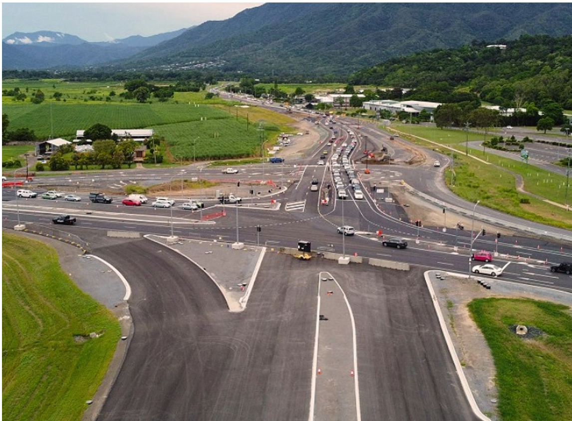
Smithfield Bypass - Brisbane, QLD, Australia.

Our successful identification and implementation of a better solution within the same timeframe underscores BG&E's commitment to achieving whole of project benefits through design.