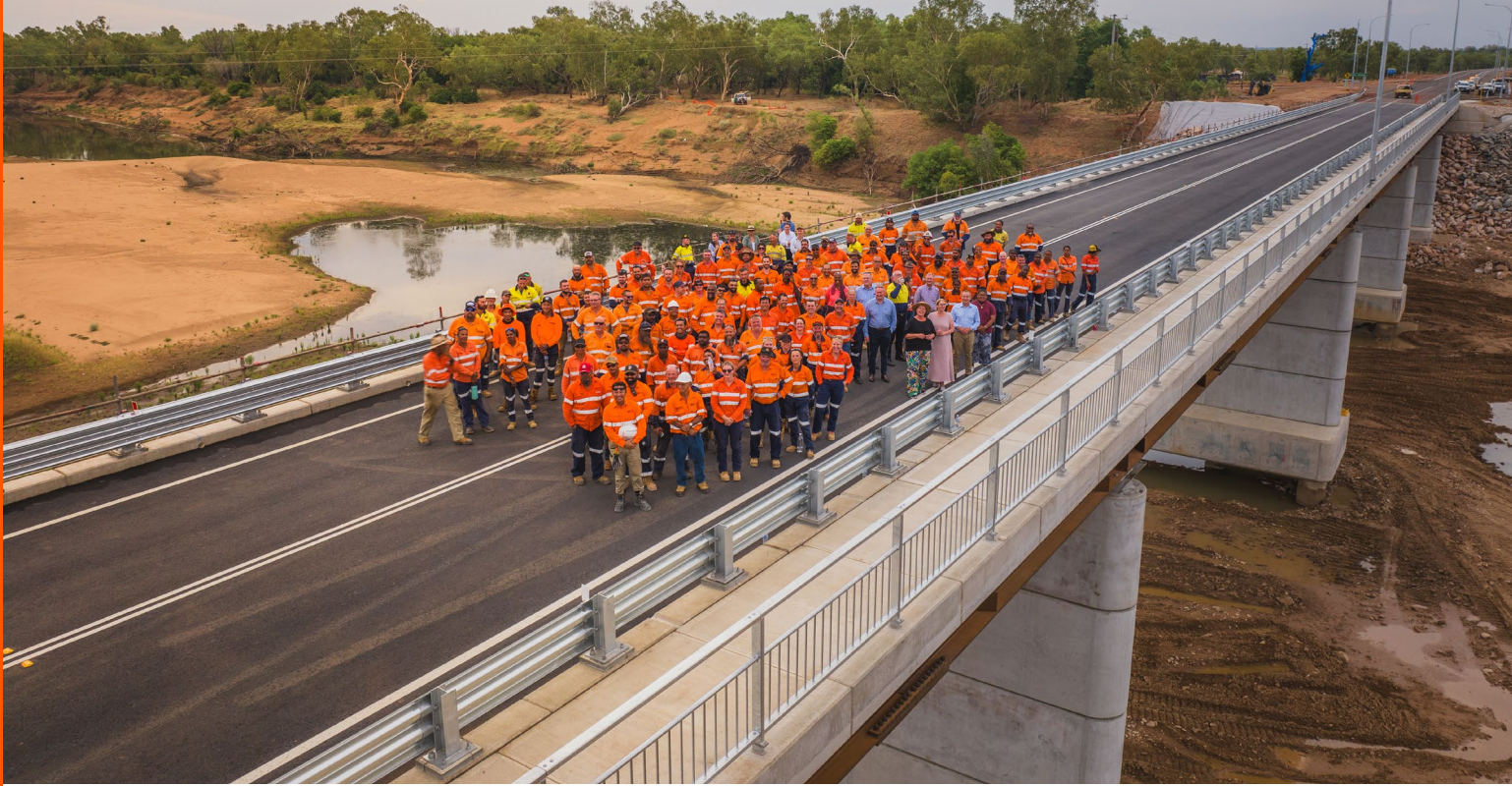
New Fitzroy River Bridge - Kimberly, WA, Australia.

We provided bridge design services for the Fitzroy River Bridge replacement project, which included: