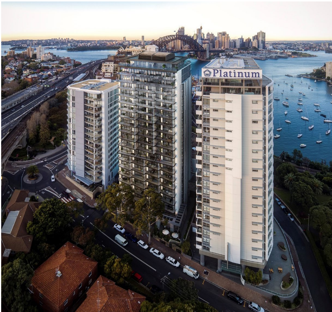
BLUE at Lavender Bay — Sydney, NSW, Australia.

The sought-after BLUE residences will support and shape the growth of Lavender Bay, one of Sydney's 'most liveable' suburbs.