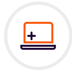
Digital inc. BIM & GIS