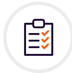
Design Management Services & Coordination