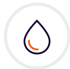
Water Infrastructure inc. Hydraulic Infrastructure