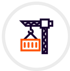
Construction & Temporary Works