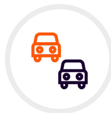
Traffic & Transport Planning