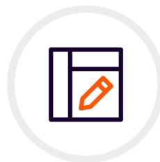
Land & Estate Planning