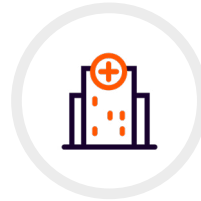
Hospital & Health