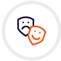
Cultural & Heritage