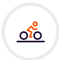
Sports & Recreation