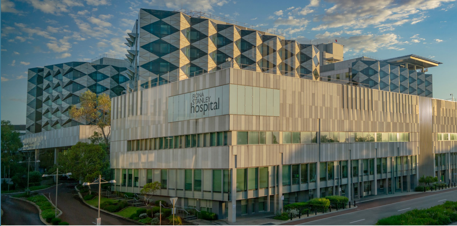
Fiona Stanley Hospital — Perth, WA, Australia.