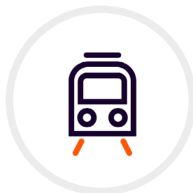
Road & Rail Infrastructure