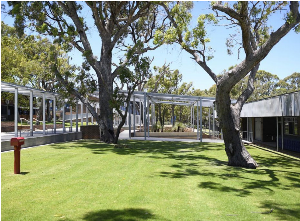
Carine Senior High School — Perth, WA, Australia.

This redevelopment not only addresses the current needs of the school community but also positions Carine Senior High School as a beacon of innovative and inclusive education for the future.