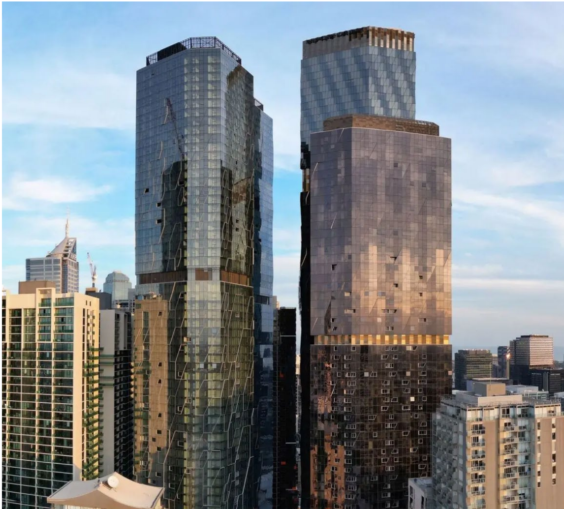
West Side Place — Melbourne, VIC, Australia. Façade services provided.

Our in-house multidisciplinary teams deliver considered and sustainable built solutions, informed by strong design synergy and a clear understanding of the relationship between structural form, architectural aspiration, building services, and construction materials and methodologies.