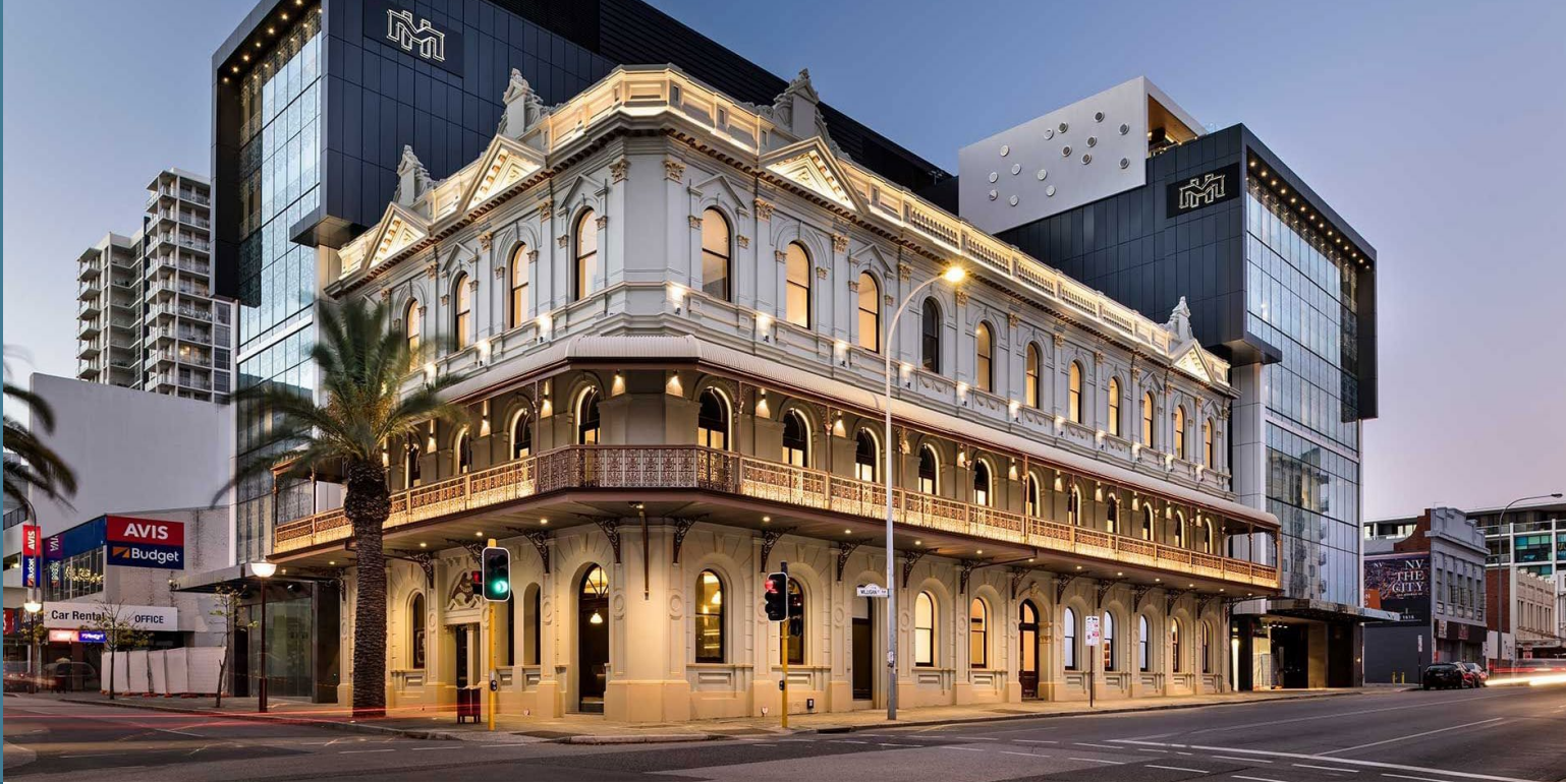
Melbourne Hotel — Perth, WA, Australia. Structural Engineering services provided.