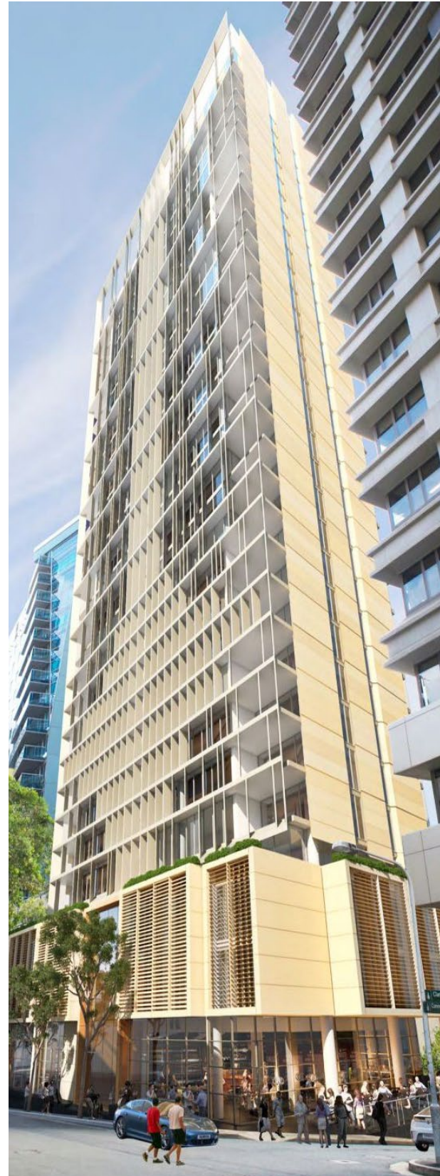
9-25 Commonwealth Street, Edition Residences — Sydney, NSW, Australia. Structural Engineering services provided.