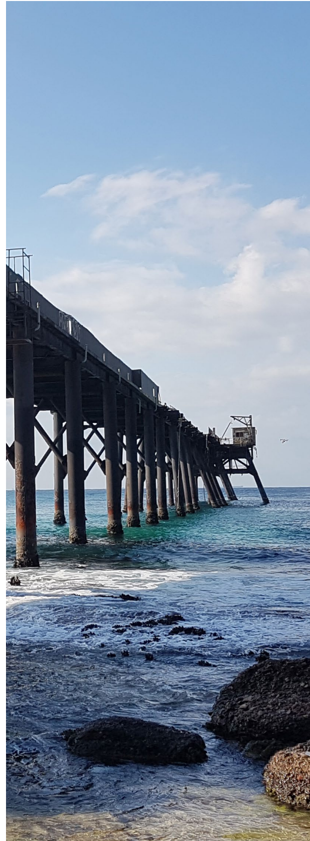
Catherine Hill Bay Jetty — Catherine Hill Bay, NSW, Australia.