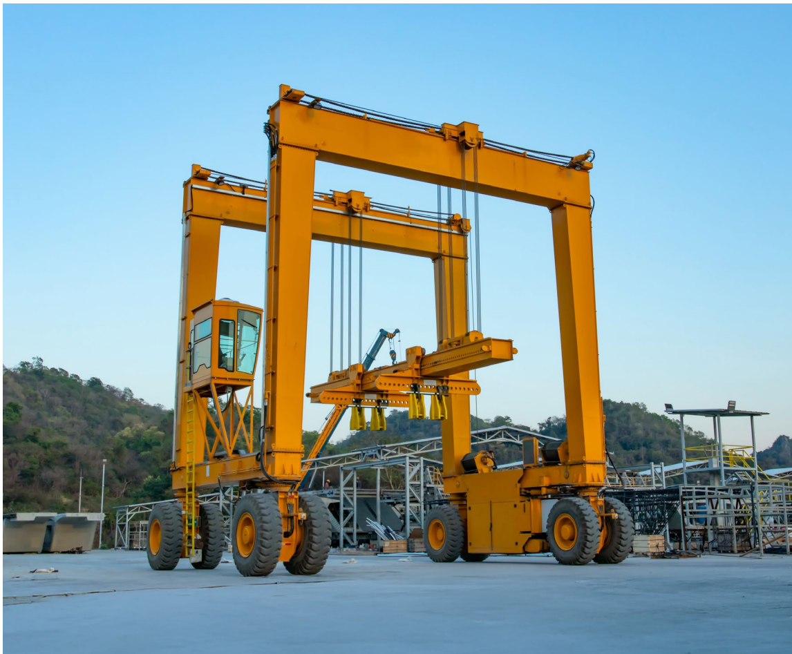
Subsea Maintenance Facility — Indonesia.