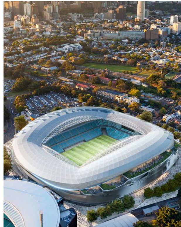
Moore Park Stadium — Sydney, NSW, Australia.