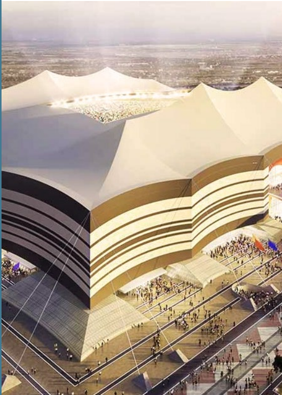
Al Bayt Stadium — Al Khor City, Qatar.