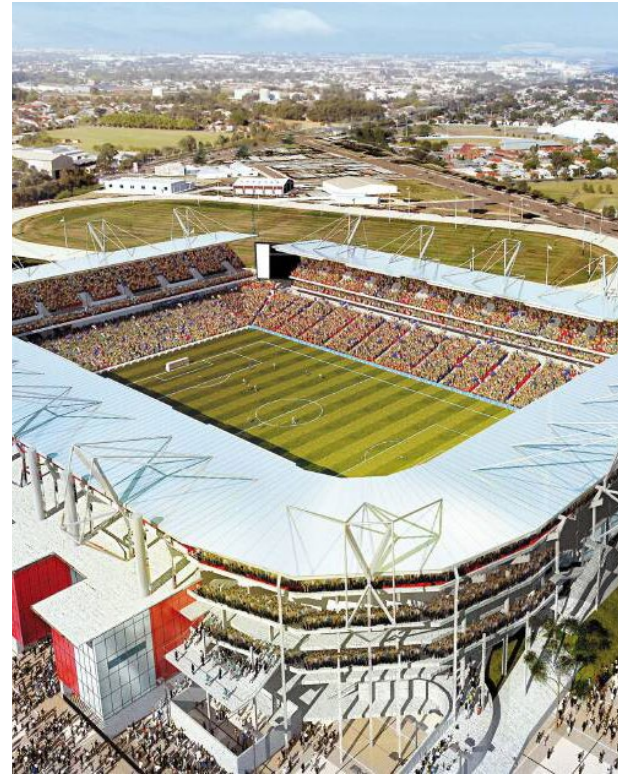
McDonald Jones Stadium — Newcastle, NSW, Australia.

Globally recognised for our innovative façade solutions, our consultants provide pioneering façade design, architectural detailing and engineering, thermal performance, materials science, remediation, and recladding solutions. Our structural engineers, building physicists and designers collaborate to realise the architect's vision with optimal outcomes for owners, constructors, occupants, visitors, and tenants alike.