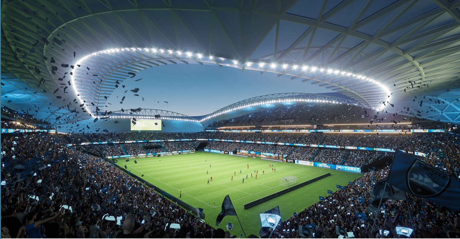
Sydney Football Stadium — Sydney, NSW, Australia.