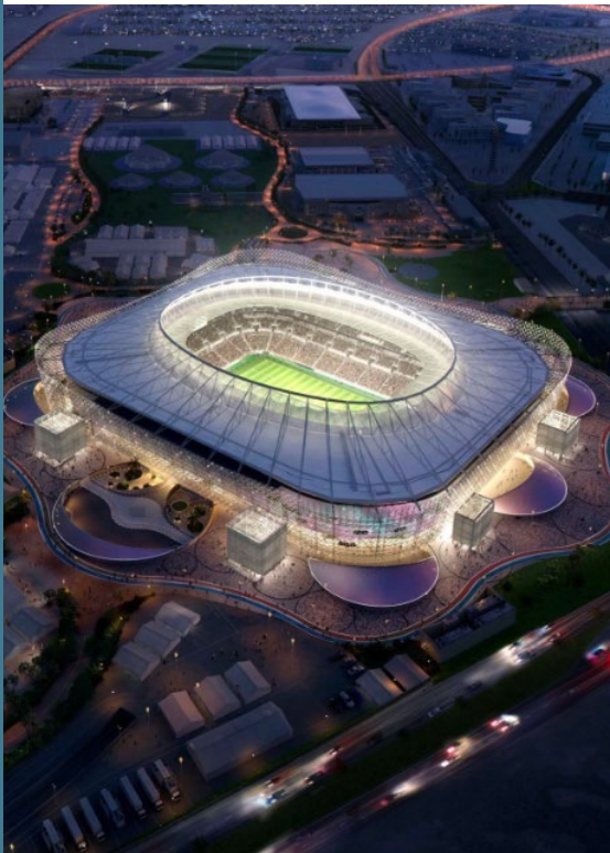
Al Rayyan Sports Club Stadium — Doha, Qatar.