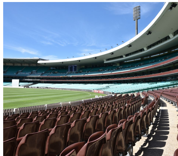
Sydney Cricket Ground — Sydney, NSW, Australia.