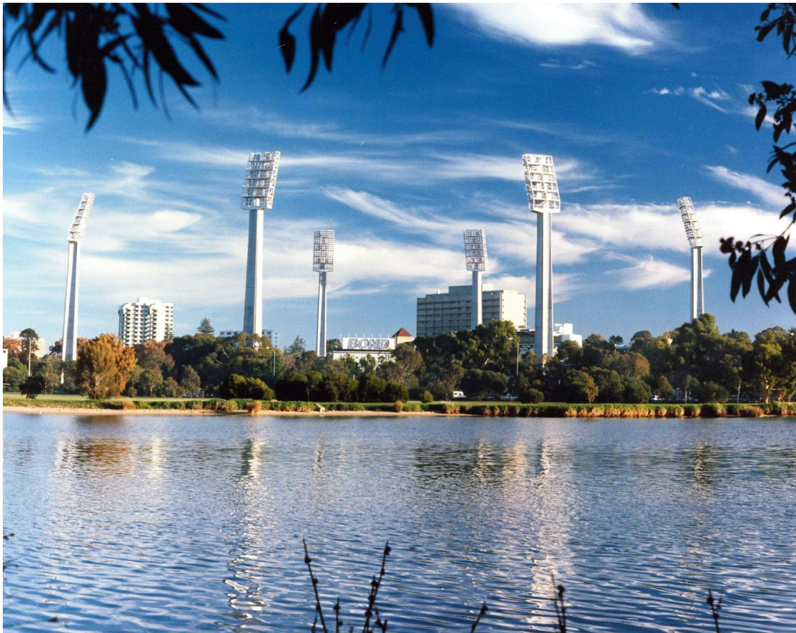
Western Australian Cricket Association (WACA) Ground — Perth, WA, Australia.

The Lillee-Marsh Stand was a large undertaking for the off-season period and the design of the precast elements allowed the primary structure to be erected in only 18 days. Grandstands and lighting towers are wind-sensitive structures in that they are susceptible to dynamic excitation. We employed state-of-the-art design to ensure the grandstand roof and light towers were as slender as possible, yet stable when subject to wind.