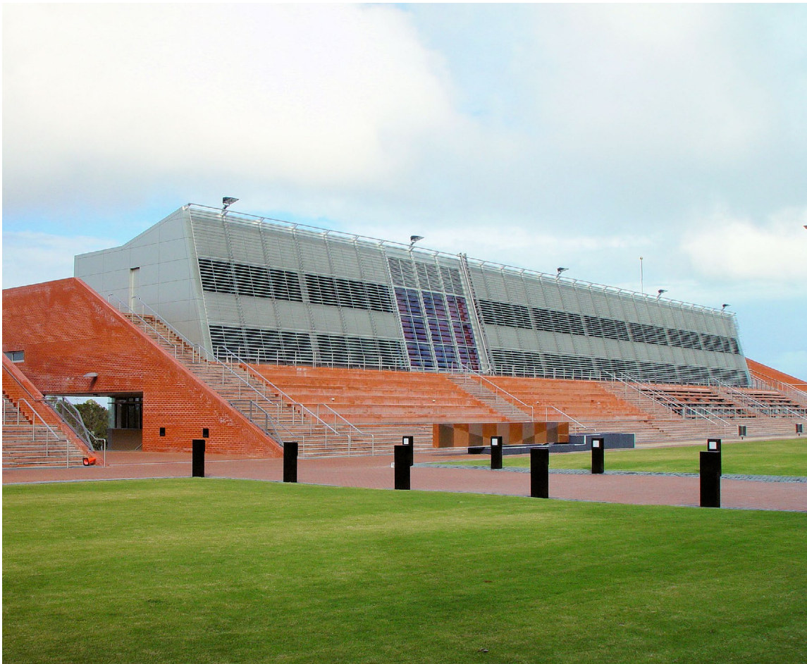
ECU Academic Building — Perth, WA, Australia.