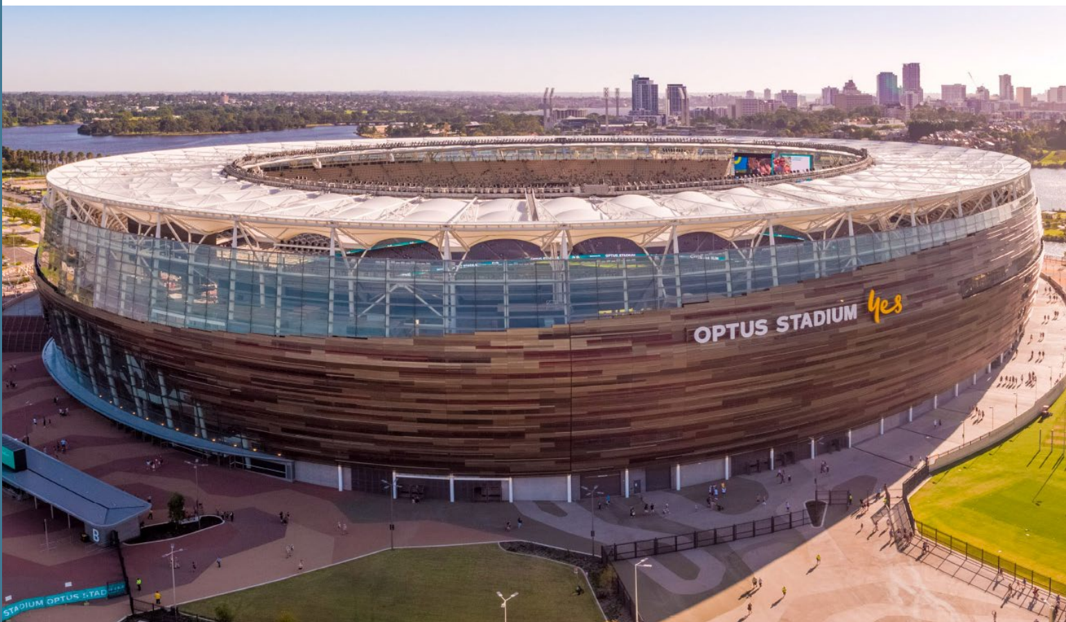
Optus Stadium — Perth, WA, Australia.

The Swan River Foreshore is a significant existing public realm resource, and the project provides an important opportunity to ensure that this resource is maintained and enhanced from environmental, infrastructure, health and safety, and ecological perspectives.