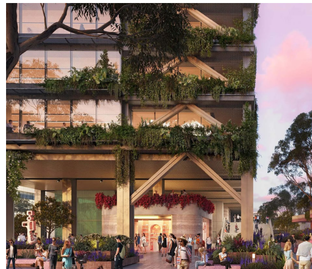
Castle Towers Zone 3 Redevelopment — East Village Office — Castle Towers, NSW, Australia.