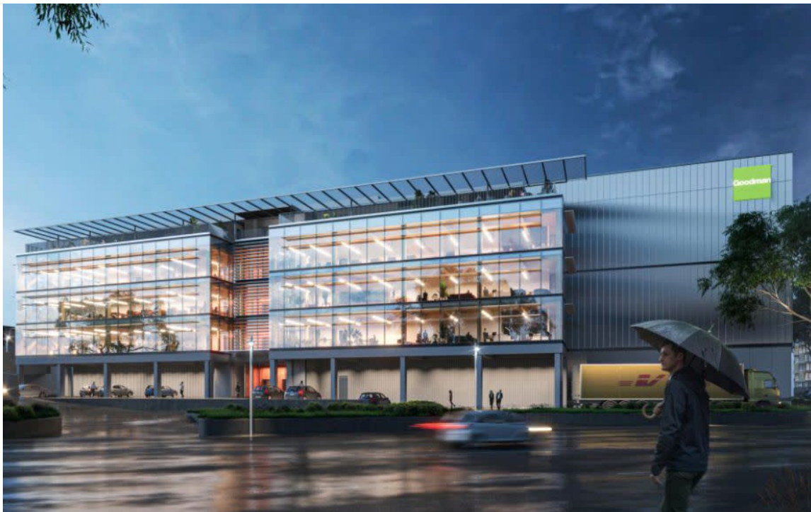
Gardeners Road Distribution Centre — Alexandria, NSW, Australia.